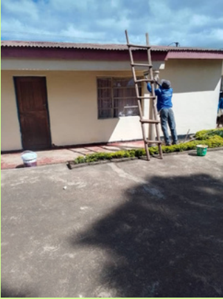
Painting the exterior.